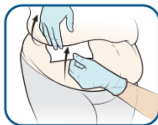
LIFT & INSERT SHEET